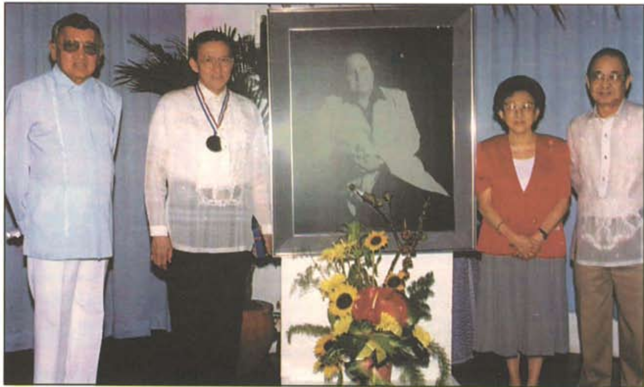
9th C.P. Manahan Memorial Lecture-

Topic: "Evolution of Therapy of Coronary Artery Disease"