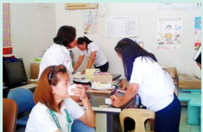
Barangay Health Officials at the Tumana Health Center

Given these results, the next project involves looking at a community with a high prevalence of leprosy and to teach and train barangay health workers, school teachers and school nurses on signs and symptoms of skin diseases including leprosy, identifying these children with skin problems to be examined by us and other dermatologists on a weekly basis. This will commence in January 2014 in Valenzuela City, in collaboration with the City Health Officer and his leprosy coordinator, the DepEd and volunteer dermatologists from the Philippine Dermatological Society.