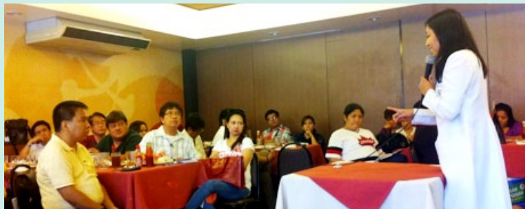
Feedback of LAM2 results to health center physicians taking part in the LAM 2 research study, 2012.

In 2011, an investigational study using LAM-specific antibodies was conducted with Otsuka Pharmaceuticals to detect Mycobacterium tuberculosis in sputum. It is the first stage of an exploratory study of a new diagnostic TB test using lipoarabinomannan (LAM), a component of the cell wall of Mycobacterium tuberculosis . Lipoarabinomannan (LAM) is a major component of MTB, comprising up to 1.5% of total bacterial weight. The project was designed as a point-of-care test, combining expertise with LAM and immunochromatographic tests which would determine LAM's placement in sputum specimens with pulmonary TB.