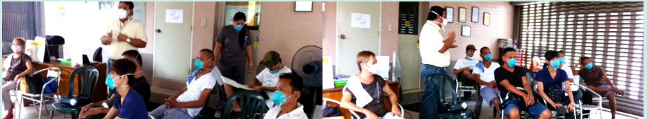
Orientation for the Study 213 project on the Delamanid drug for MDR-TB patients.

As of June 2013, 13 subjects were on-going treatment and study procedures. Future plans for the study include the continuation of active case-finding to provide treatment for MDR-TB patients in neighboring cities without easily-accessible Programmatic Management of MDR-TB (PMDT) coverage. With the reintegration of TDFI into PMDT on July 2013 through the TDFI Satellite Treatment Center (STC), case finding was improved, with the STC contributing a patient to the study. Members of the Clinical staff are continuing to come up with strategies to better improve subject participation in the study.